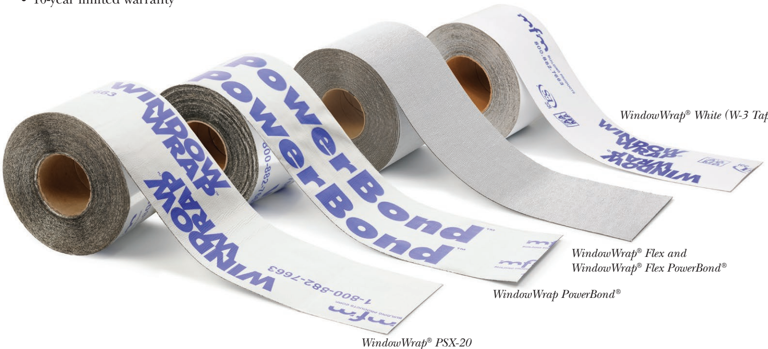
WindowWrap® White (W-3 Tape)

WindowWrap® products are suitable for new construction or home renovation projects. These professional grade products are proven performers and reduce expensive call backs.